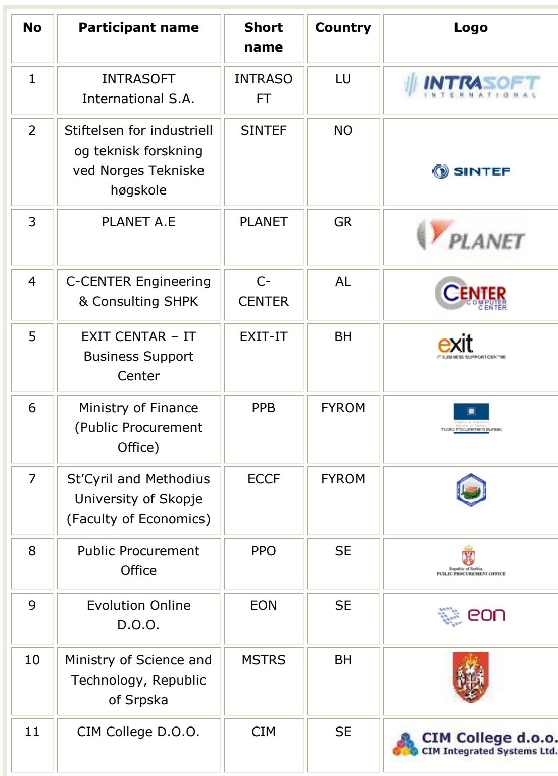
Table 2: Consortium Members